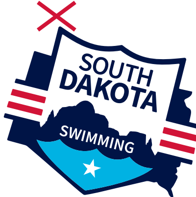
ROTATION AGAINST VISUAL BASELINE