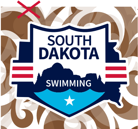
PLACEMENT ON BUSY BACKGROUNDS