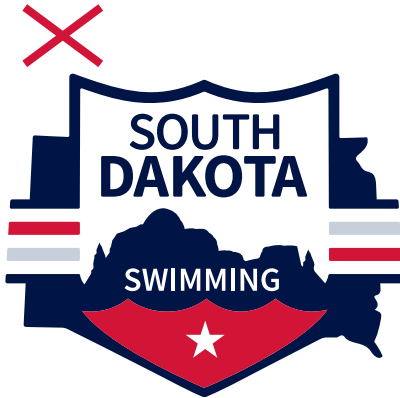
SELECTIVE COLOR EDITS